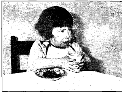
GIVE THE YOUNG CHILD ONLY ONE OR TWO FOODS AT A TIME

Whether the children are served as a part of the family group or separately should be determined by circumstances. Choose the way that is easiest for the mother and best for the children; it need not be the same for every meal. In homes where the evening meal must be late or the noon meal hurried the children will be better off if served earlier than the rest of the family. When children eat apart from adults there are fewer distractions and usually no questions to be answered about differences between their food and that of the grown-ups. If questions arise at the family table let the children know that they do not eat the same dishes that grown-ups eat just as they do not wear the same kind of clothes.