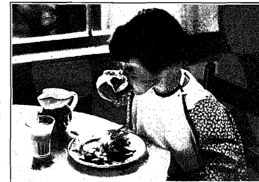
THE FAMILY TABLE WITH THE CHILD'S BRIGHT DISHES

Allow the ill, tired, or upset child to miss a meal or to eat lightly while he is temporarily out of order, and place no emphasis on refusals at such times. He may need rest or wholesome activity to restore his appetite. If poor appetite persists in spite of all efforts, consult a physician.