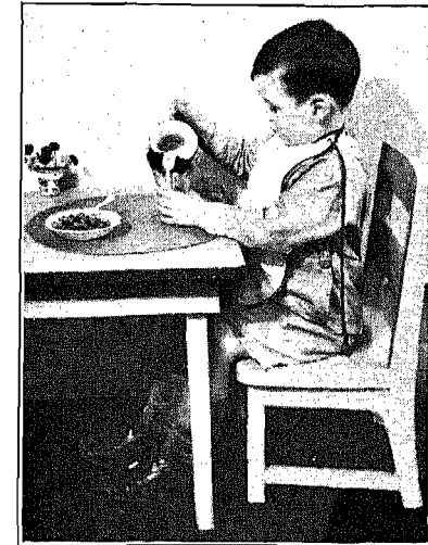
INTENT ON POURING HIS OWN

The idea of reward for success in eating is good if carefully used so that it does not seem to be a bribe. The reward may be only a word of praise. It may be a favorite dessert or a longer playtime, coming unpromised but definitely as the result of eating an unfavored food willingly, or of finishing a meal promptly. When the child does not finish let some penalty be the consequence. The parent may take the stand that if the child is not hungry