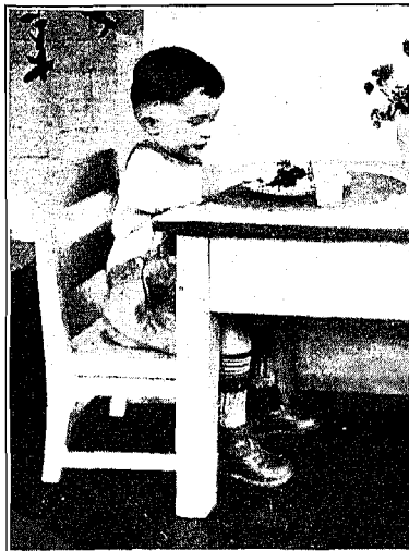
LEARNING TO FEED HIMSELF

Sometimes only a small change in table tactics is necessary to retrain the child who has been allowed to slip into bad food habits. If refusal to eat centers around a particular food, try a different method of preparing it. Even a new dish or device for serving, such as a small pitcher from which to pour the milk or a straw through which to sip it, may create a new interest in eating. If not, it may be