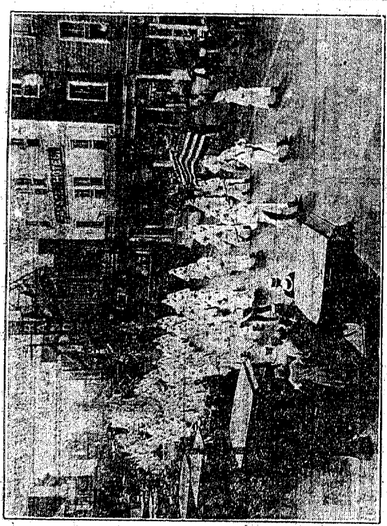
Thousands of Klansmen paraded in Long Branch, New Jersey, on the Fourth of July. The photograph shows a section of the parade, which was one of the biggest Klan processions yet to have been held in the east, as it passed through the streets of Long Branch.