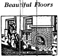
C. B. WOOSTER Floor Sales and Contractors Hardware, New Laid and Finished 1232 W. HIGHLAND AVE. Phone 6449 INDIANAPOLIS

EDITOR LAUDS NOBLE WORK OF THE KLAN Questionable Resorts Closing Doors at Caldwell, O.—Parade Is Held CALDWELL, O., May 22.—Following a parade by the Ku Klux Klan at this place last Friday night, the Noble County Leader says in part that he does not directly associated with the Klan but the things that the organization has done and are doing, therefore watching with deep concern the progress of this movement, and are gratified to hear that steps are being taken looking toward the cleansing of our public school from this most obnoxious and un-American influence.