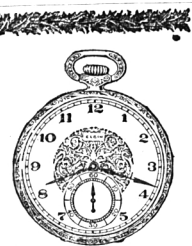
The ELGIN "STREAMLINE" in 25 year Green Gold Engraved Case, $40

TO make GIFTS that do more than merely please—You will want to select an