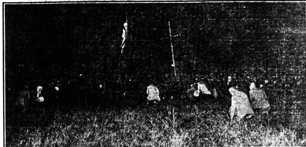
The above is a picture taken at a ceremonial held within a few miles of Lexington, Kentucky, recently. A large class of candidates was taken into the organization. The Klan in the vicinity of Lexington is growing very fast.