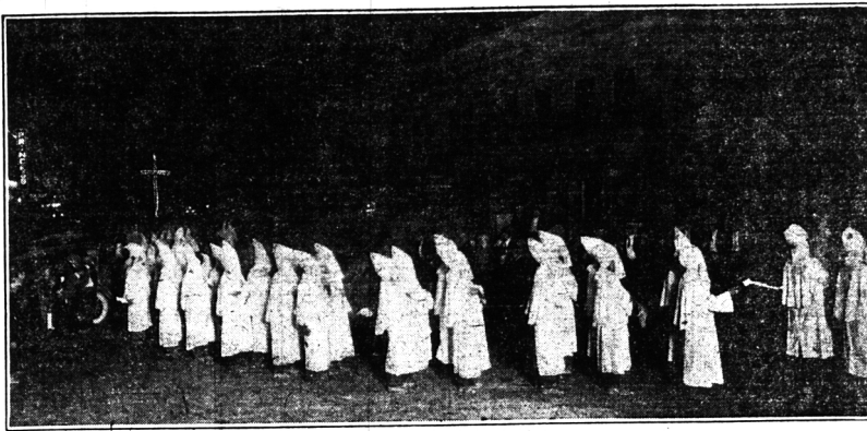
The above flashlight photograph shows a section of the parade at Bloomington, Indiana, Saturday, October 13. It was taken at the corner of Walnut and Seventh streets as the parade halted for a moment. In the background may be seen the Indianapolis drum corps of sixty-four pieces, marching four abreast.